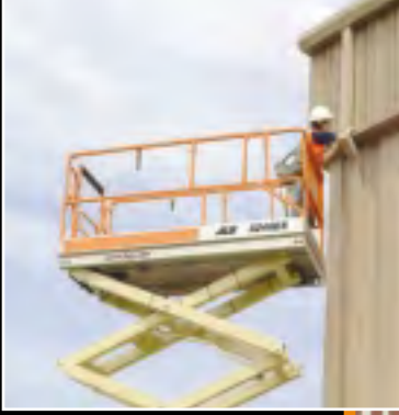
Longer Duty Cycles Keep You On the Job Longer